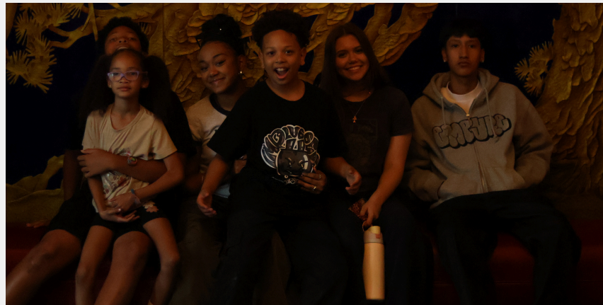
INSIDE PEEK of Rio Salado Audubon Center – Phoenix, AZ